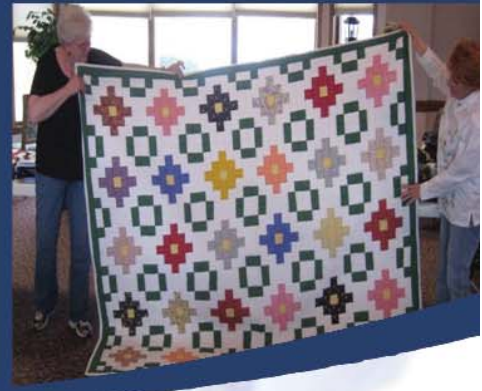
Above: The flower quilt, done by the Memory Stitches Quilting Ladies Club, brightened the day.