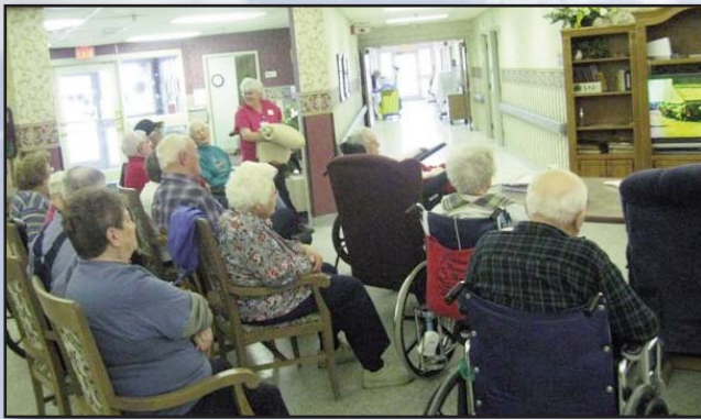
Above: Popcorn and a movie at Valley View.

For our time now here at Valley View Living Center we are awaiting the warm weather and a chance to get outdoors and breathe in the spring time and bloom where we are planted.