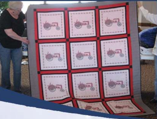
Above: We enjoyed the tractor quilt presented by the The Memory Stitches Quilting Ladies Club.