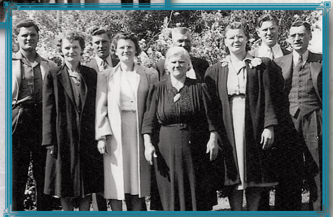
Absalon family photo.