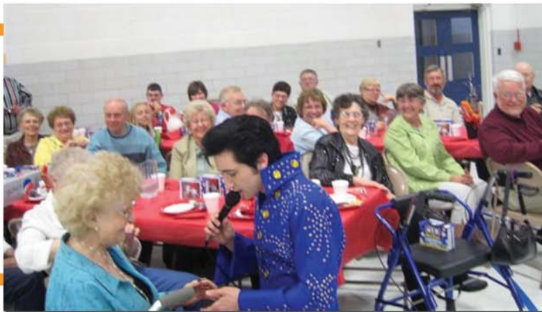
Bev O'Neel being serenaded by Elvis