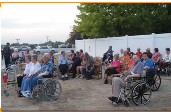
Residents getting ready for the fireworks to take place.