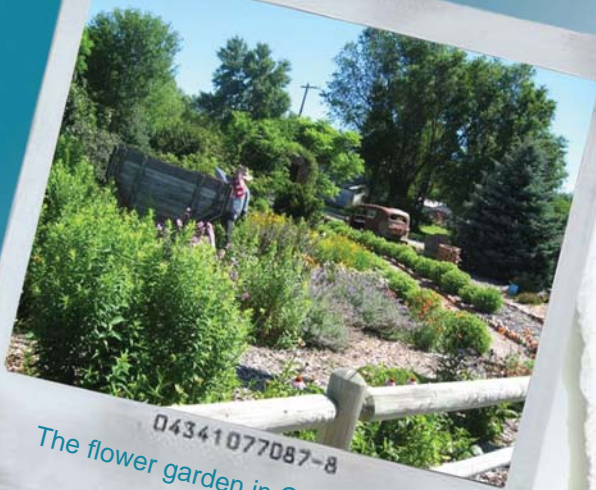
04341077087-8 The flower garden in Comstock.

217 Westridge Drive, Ord, NE 68862 www.ValleyCountyHealthSystem.org 308.728.3211